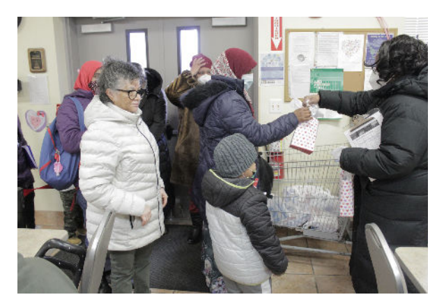
Women in need can take home up to three hot meals from the Oasis dining room. Your gifts mean a family eats, despite rising food costs.

Yes, I'd like to give a woman and her child a hot meal in this season of hope. And I will support all the vital antipoverty programs Oasis provides to women and children in need.