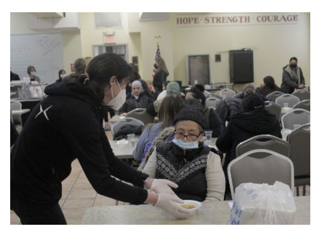
The need is great. Your contribution ensures that a woman receives a hot meal at lunchtime, which makes a great difference in her life.

Your gifts of food, hot meals, and support greatly ease the burden of those who, having battled the pandemic, now face a different crisis.