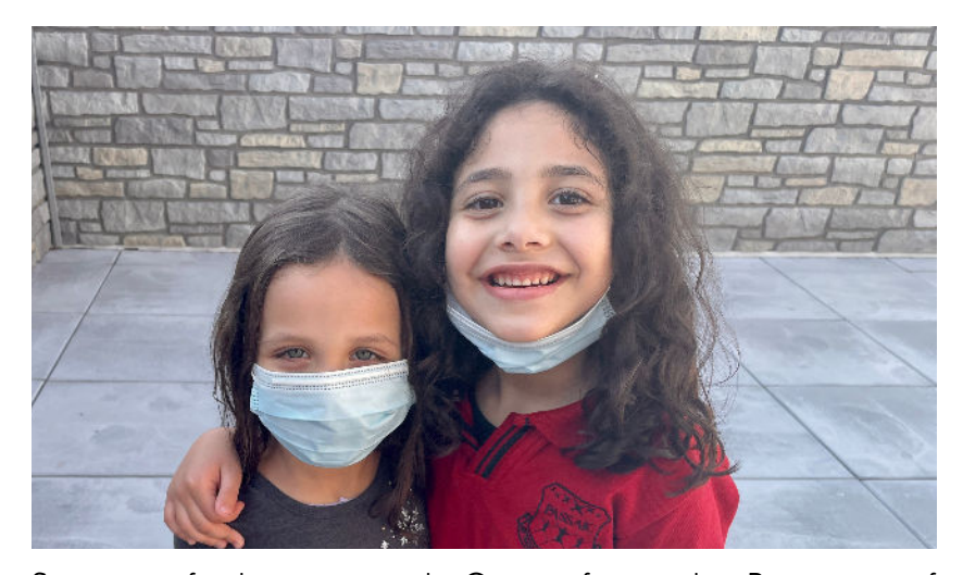
Sisters pose for the camera on the Oasis rooftop garden. By supporting families, you help improve children's academic outcomes.