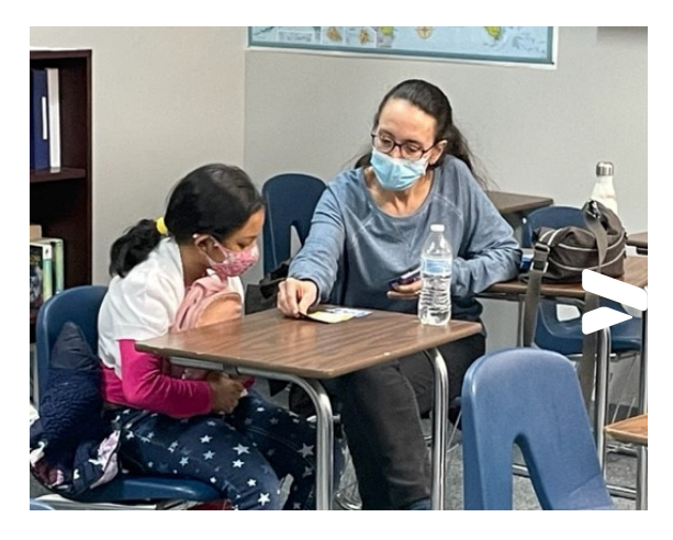
Your gifts help reverse pandemic learning loss.

Your support changes a child's future. Thank you.