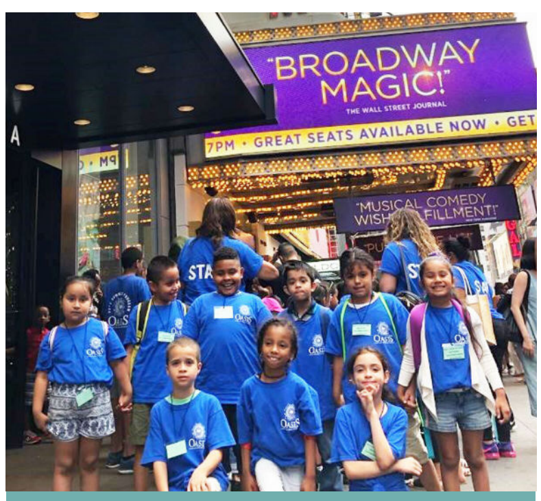
Paterson Public School 2 kids experience their first trip to Broadway, and for many, New York City.

Fifty-one low-income Paterson Public School 2 children got daily classroom instruction, led by certified teachers, for five weeks throughout July and into August. The program gave these kids invaluable summer learning time—proven to have a positive impact, especially on children performing below grade standards. This could not have happened without your support.