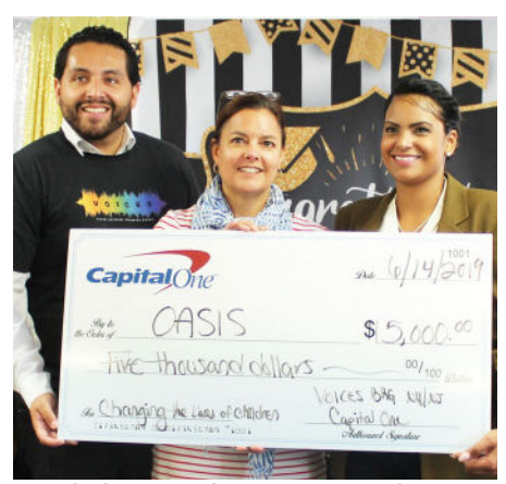
Capital One volunteers organize teen party and donation.