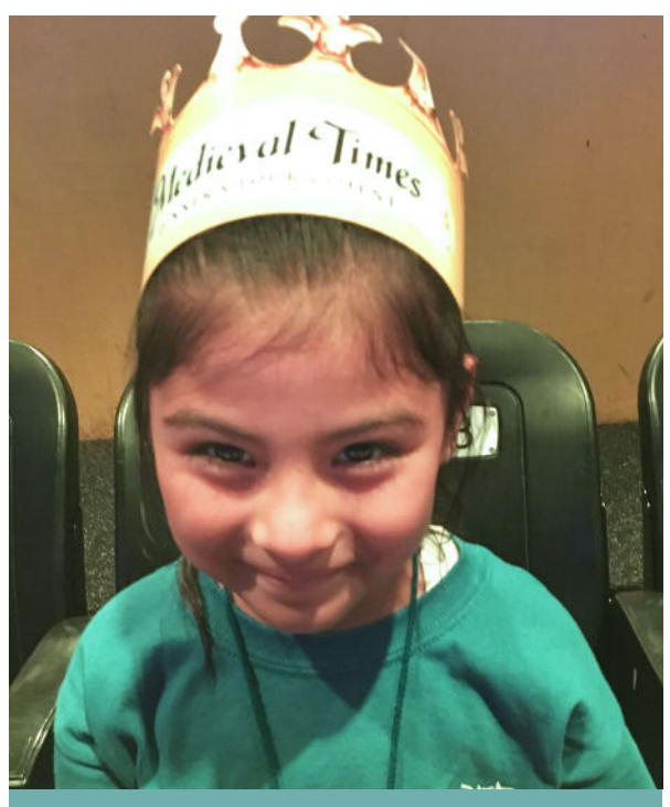
Children learned about knights and chivalry at Medieval Times.